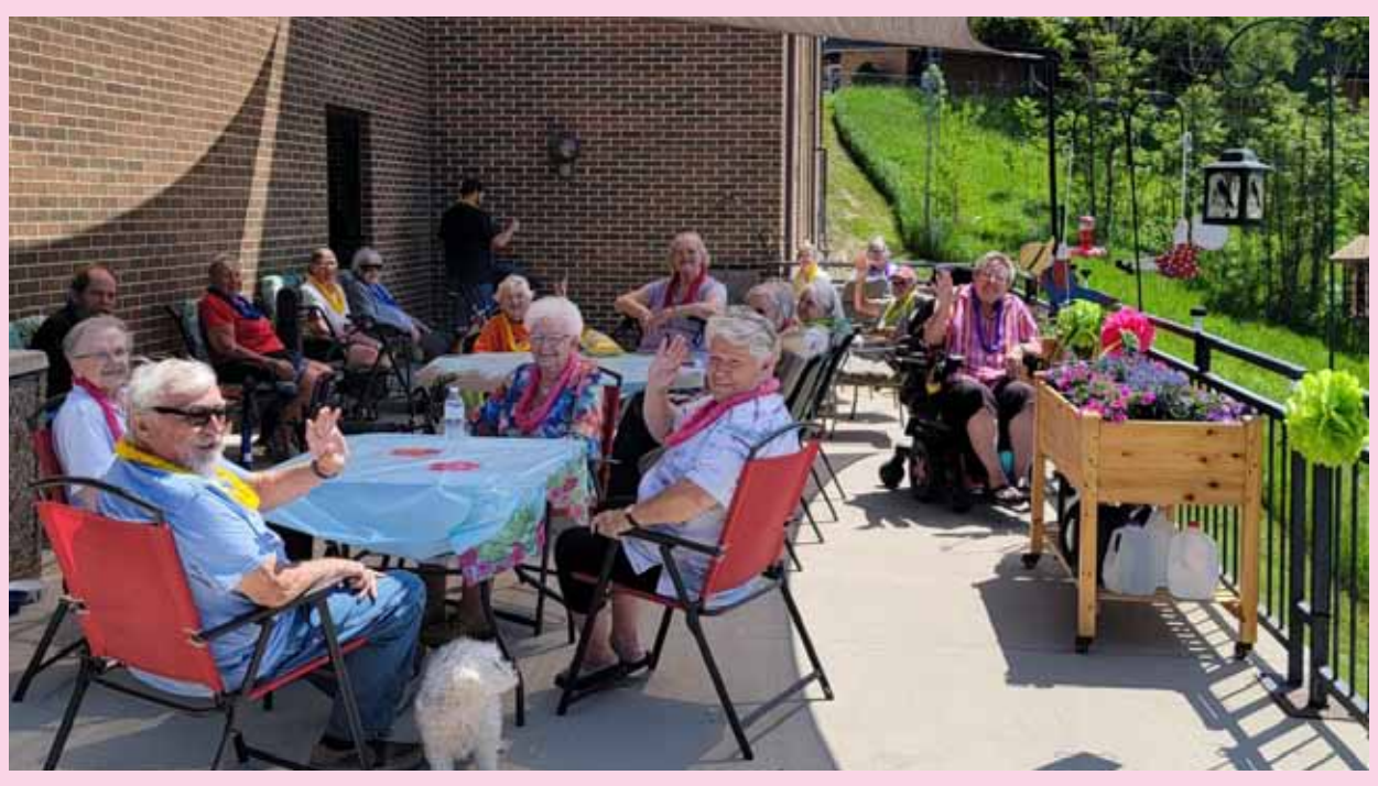
Heritage Heights tenants enjoyed a luau on their patio to celebrate Older American's Month. It was a perfect summer day to enjoy great company and delicious food!

Nowadays their time is often spent revisiting their lifetime of memories, making new ones with new friends, and of course still sharing an occasional ice cream bar. For me as the writer and person who is privileged enough to listen to and share their story and others like it, I can't help but look at these two photos separated by 85 years of life and be so thankful their journeys led them both to Silveridge and back to each other.