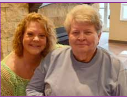
The ladies of Gracewell were happy to host the annual Spring Fling and spend a day with their favorite women!