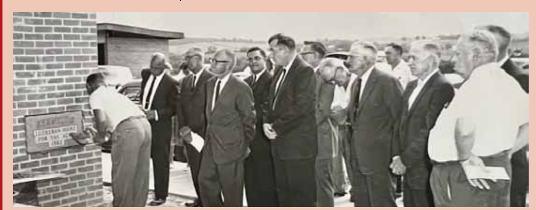
The Eventide Cornerstone was placed in the fall of 1962.