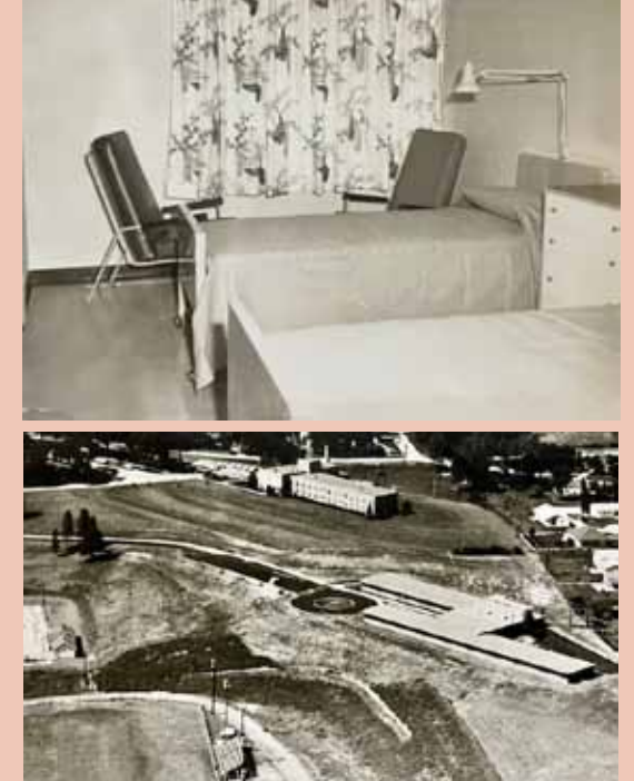
Eventide was the first of its kind in the state to be all-electric. During the project McClellan Electric installed over 70,000 feet of electrical wire.