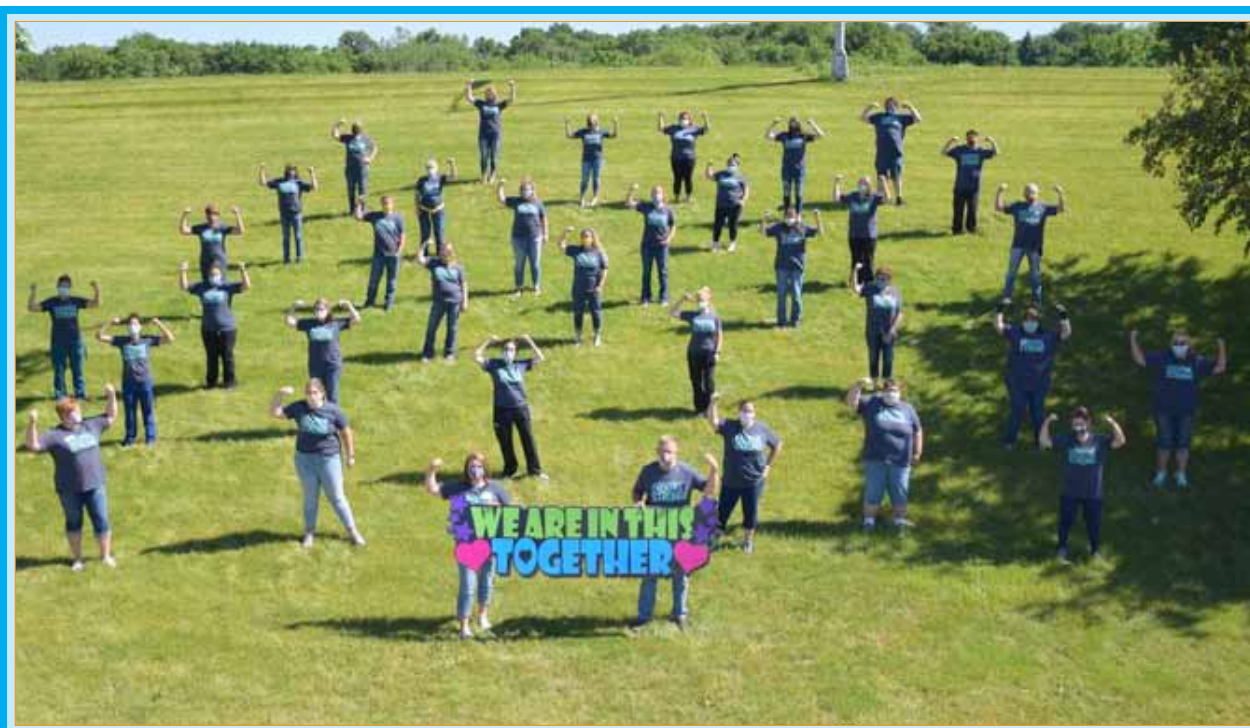
Eventide Campus Employees remain strong in their efforts to keep residents and tenants healthy and safe during the COVID-19 crisis.

I will leave you with a reminder that my favorite uncle closes with, every time we speak! DON'T WORRY, BE HAPPY!